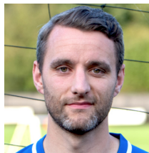
TOM RIPLEY DEFENDER